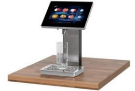
Open Frame HMI