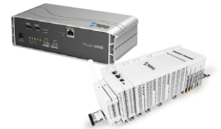
Smart Meter & IoT Gateway