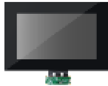
Touch Display Module