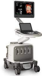
Medical Diagnostic Monitor