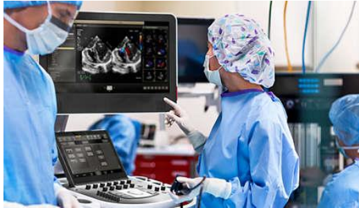
MEDICAL & HEALTHCARE