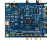
ARM PCBA Design